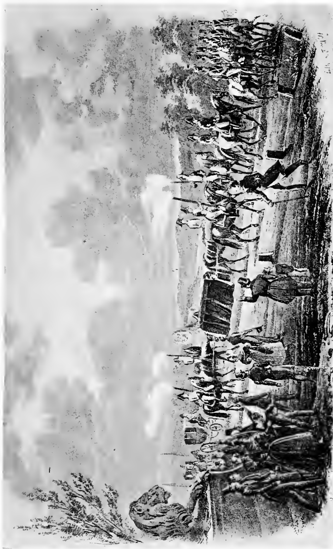
THE BODY OF THE DUKE OF REICHSBART WAS REMOVED FROM SCHÖNBRUNN TO VIENNA DURING THE NIGHT OF JULY 23, 1832

From a sketch by Von Heide. In the Imperial and Royal Court Library, Vienna